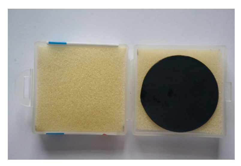
Packaging Image of ACS Material Graphene Oxide Film - Super Paper