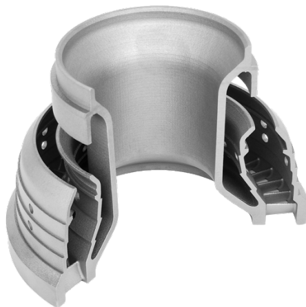
Sample of 3D-Printed Combustor

Disclaimer: ACS Material LLC is the sole distributor of XDM 3D Printing Technology in the US. ACS Material LLC believes that the information in this Technical Data Sheet is accurate and represents the best and most current information available to us. ACS Material makes no representations or warranties either express or implied, regarding the suitability of the material for any purpose or the accuracy of the information contained within this document. Accordingly, ACS Material will not be responsible for damages resulting from use of or reliance upon this information.