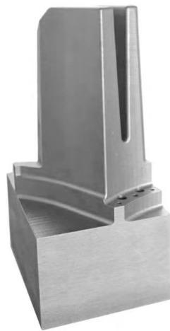
Sample of 3D-Printed Die-Casting Mould

Disclaimer: ACS Material LLC is the sole distributor of XDM 3D Printing Technology in the US. ACS Material LLC believes that the information in this Technical Data Sheet is accurate and represents the best and most current information available to us. ACS Material makes no representations or warranties either express or implied, regarding the suitability of the material for any purpose or the accuracy of the information contained within this document. Accordingly, ACS Material will not be responsible for damages resulting from use of or reliance upon this information.