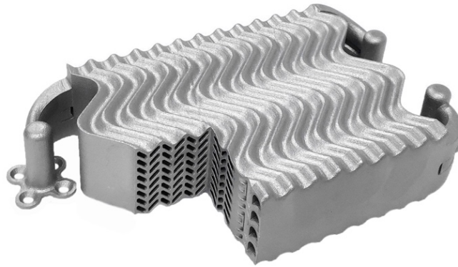
Sample of 3D-Printed Heat Exchanger