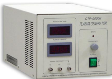
Photo of Modulated Pulse Low-temperature Plasma Experimental Power Supply

Rated input voltage: 220v | Rated capacity: 1kVA | Frequency: 50Hz | Output voltage range: (0-250) V Rated output current: 4A | Number of phases: 1 | Weight: 6.5kg | Insulation heat class: F