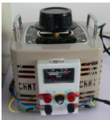
Photo of Voltage Regulator